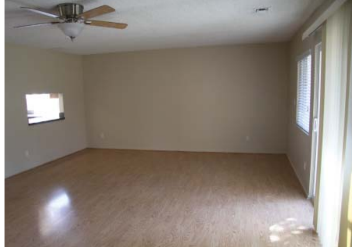
TOP RIGHT: View of the living room. It has access to the patio as well.