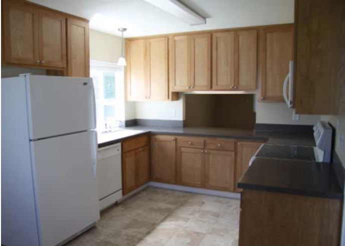
TOP LEFT: Kitchen with standard amenities. The kitchen has access to the dining room.