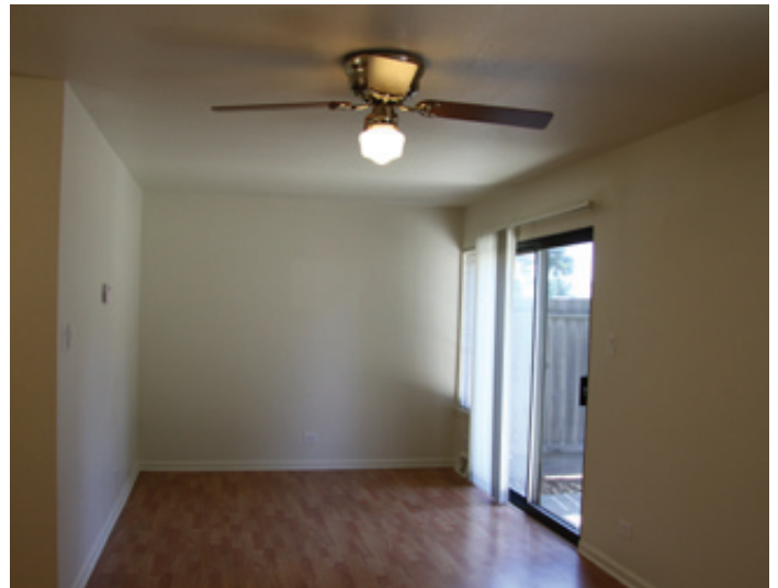
BOTTOM LEFT: All bedrooms have laminate hardwood flooring, heating units, and ceiling fans.