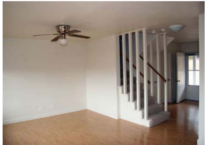
BOTTOM LEFT AND RIGHT: All bedrooms have laminate hardwood flooring, heating units, and ceiling fans.