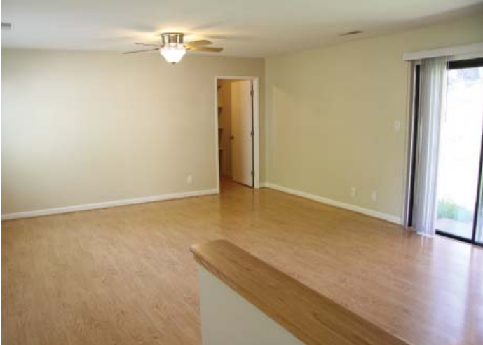
TOP LEFT: Living room with access to storage and patio.