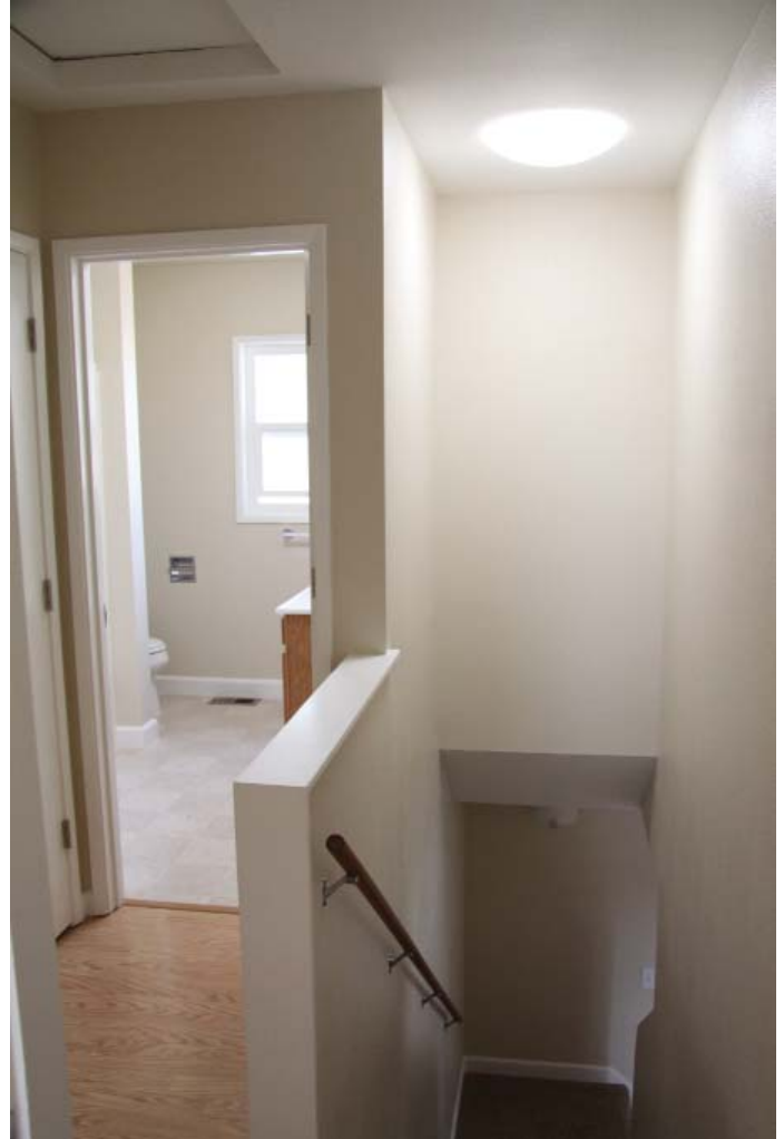
TOP LEFT: Kitchen with standard amenities. The kitchen has access to the dining room, living room, laundry area, and the front porch.