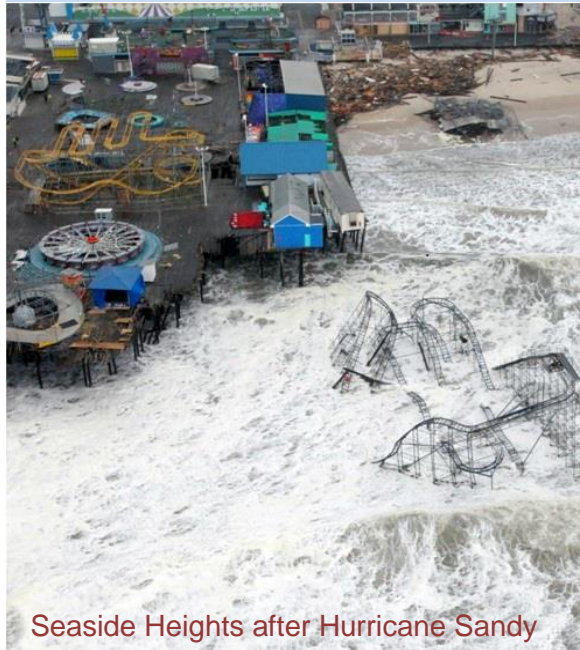
Seaside Heights after Hurricane Sandy