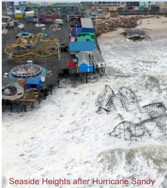
Seaside Heights after Hurricane Sandy