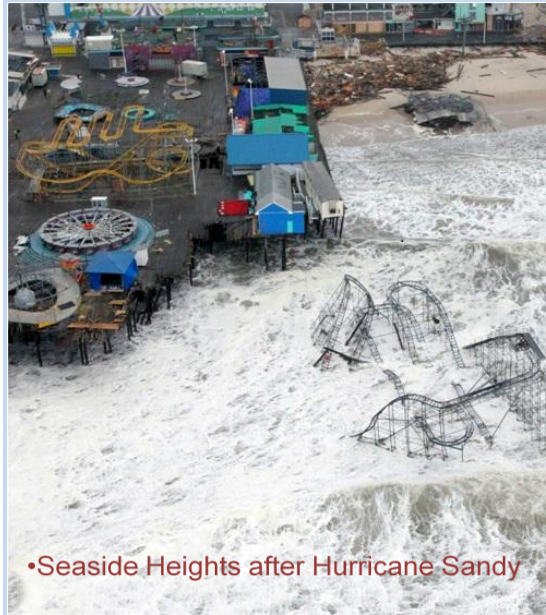
•Seaside Heights after Hurricane Sandy