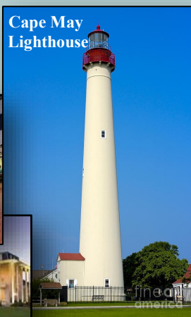
Cape May Lighthouse

For Information about the local area, please contact the USCG Training Center Cape May MWR Office at 609/898-6922