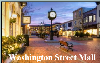
Washington Street Mall